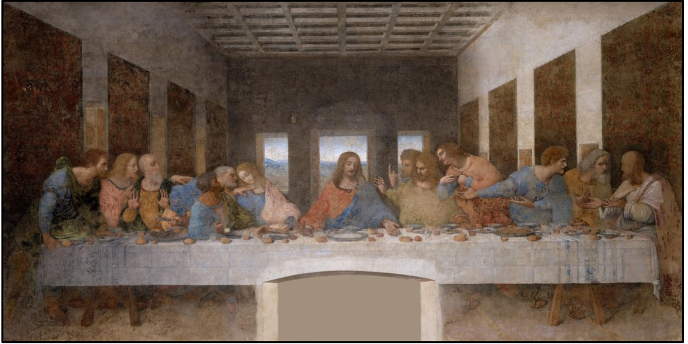
"Il Cenacolo" by Leonardo da Vinci, 1490s