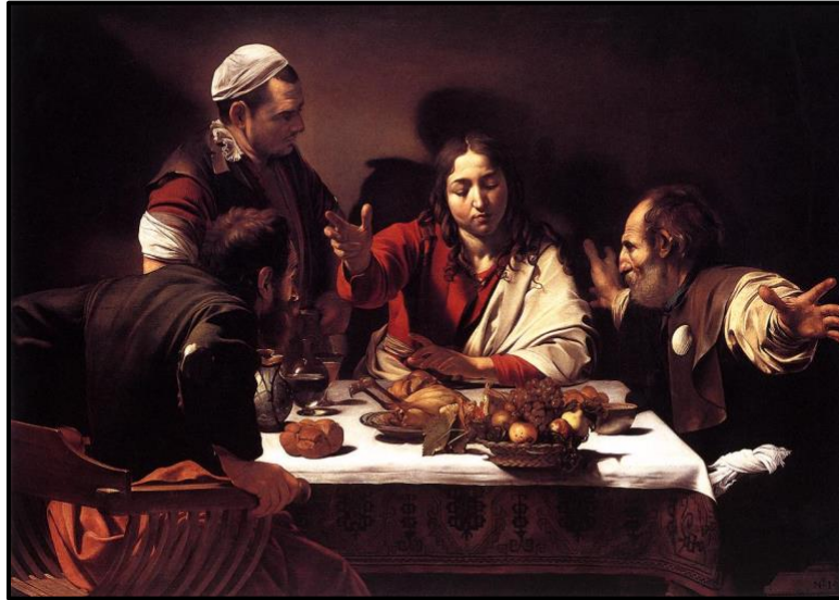
"Supper at Emmaus" by Caravaggio, 1601-02