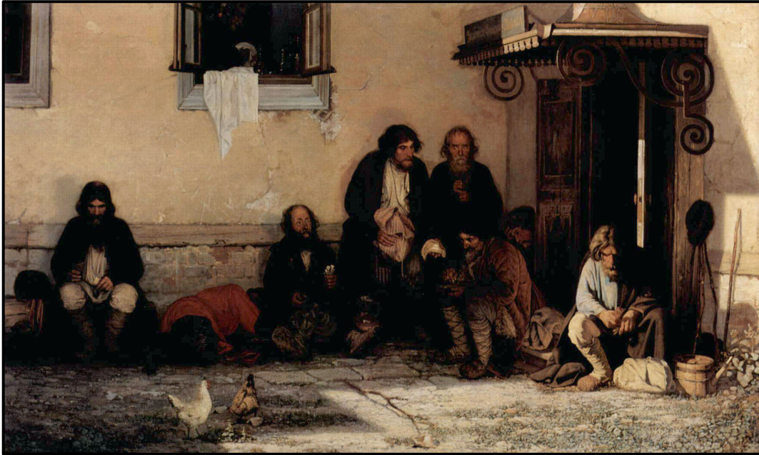
"The Bread Line" by Grigorij Grigorjewitsch Mjassojedow, 1872

Saint Stephen's Episcopal Church is a part of the Episcopal Diocese of Montana 1241 Crawford Drive Billings, Montana 59102 Office Phone: (406) 259-5017 Email: ststephensmt@gmail.com