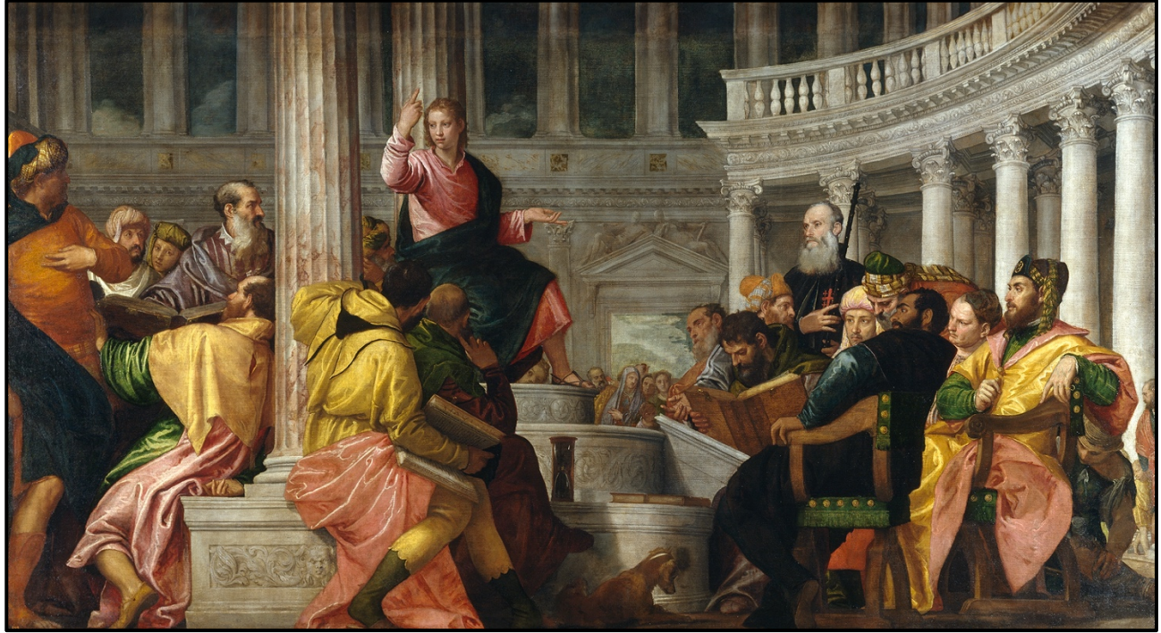
“Christ among the Doctors” by Paolo Veronese, 1560

Saint Stephen’s Episcopal Church is a part of the Episcopal Diocese of Montana 1241 Crawford Drive Billings, Montana 59102 Office Phone: (406) 259-5017 Email: ststephensmt@gmail.com