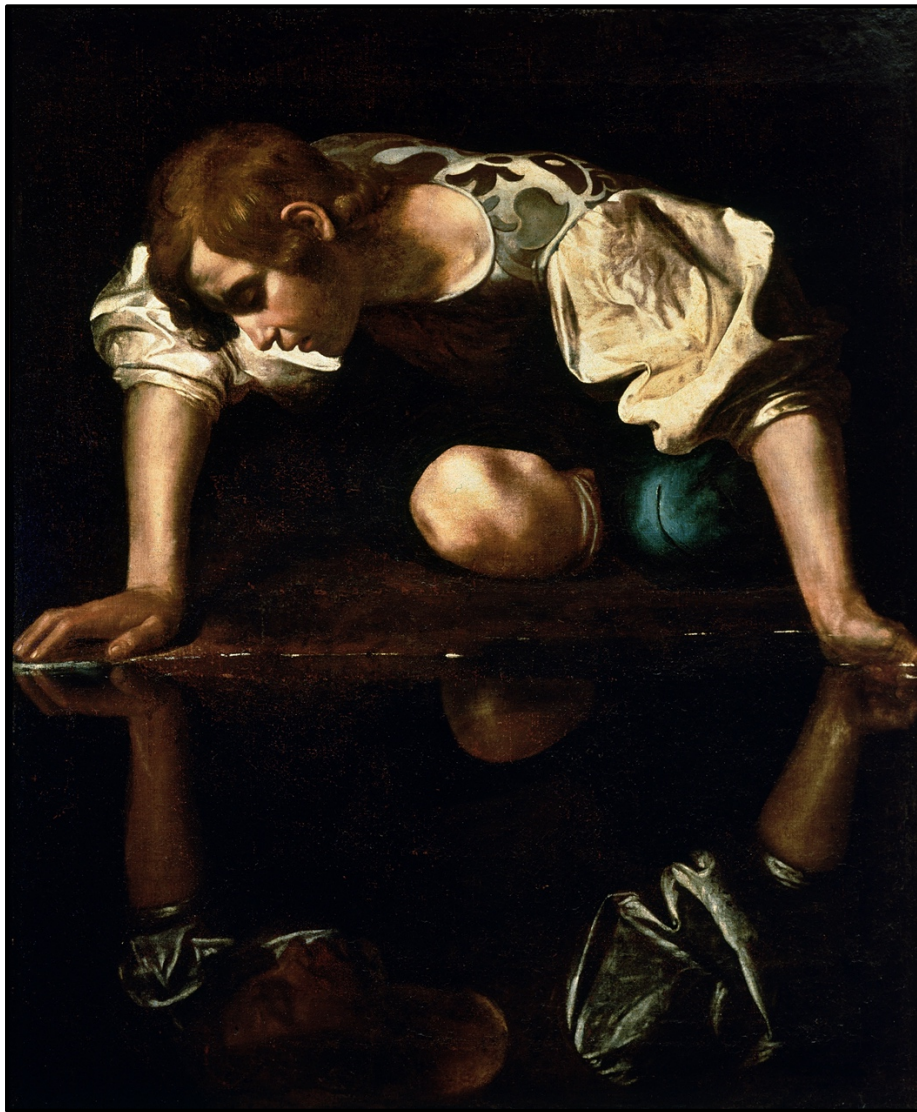
"Narcissus" by Michelangelo Merisi da Caravaggio, 1597-1599

Saint Stephen's Episcopal Church is a part of the Episcopal Diocese of Montana