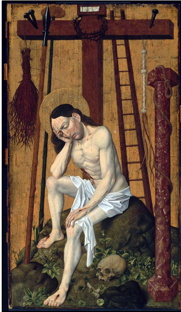
“Christ as the Man of Sorrows” by Alsatian, ~1450 - 1460

Saint Stephen’s Episcopal Church is a part of the Episcopal Diocese of Montana