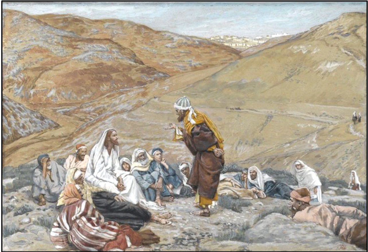
"Scribe Stood to Test Jesus" by James Tissot, ~ 1886 - 1894

Saint Stephen's Episcopal Church is a part of the Episcopal Diocese of Montana 1241 Crawford Drive Billings, Montana 59102 Office Phone: (406) 259-5017 Email: ststephensmt@gmail.com