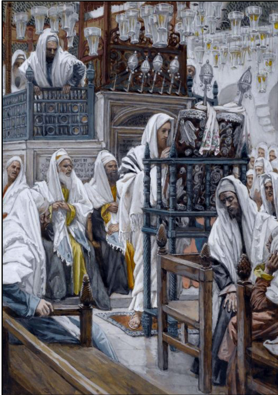
“Jesus Unrolls the Book in the Synagogue” by James Tissot, ~ 1886-1894

Saint Stephen’s Episcopal Church is a part of the Episcopal Diocese of Montana 1241 Crawford Drive Billings, Montana 59102 Office Phone: (406) 259-5017 Email: ststephensmt@gmail.com