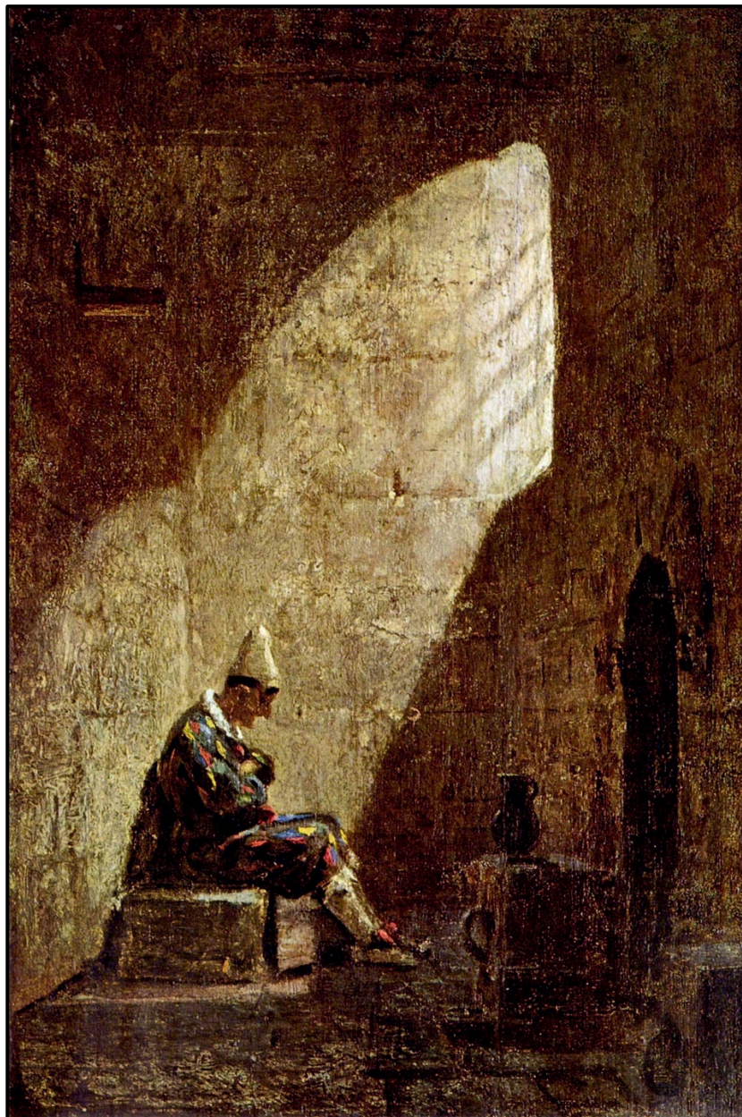
“Ash Wednesday” by Karl Spitzweg, 1855-1860

Saint Stephen’s Episcopal Church is a part of the Episcopal Diocese of Montana