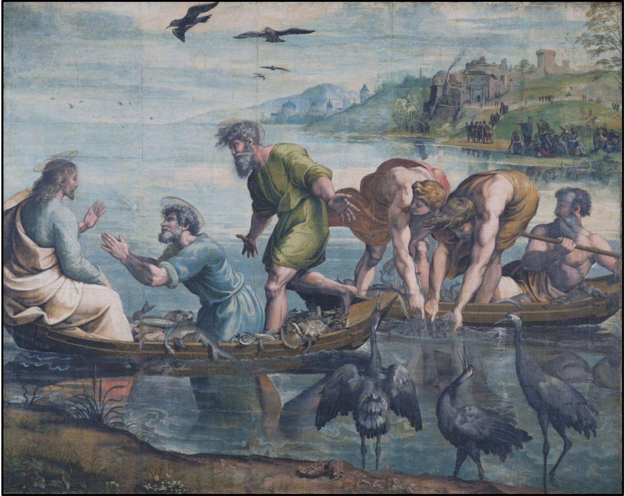
"Miraculous Draught of Fishes" by Raphael, 1515

Saint Stephen's Episcopal Church is a part of the Episcopal Diocese of Montana 1241 Crawford Drive Billings, Montana 59102 Office Phone: (406) 259-5017 Email: ststephensmt@gmail.com