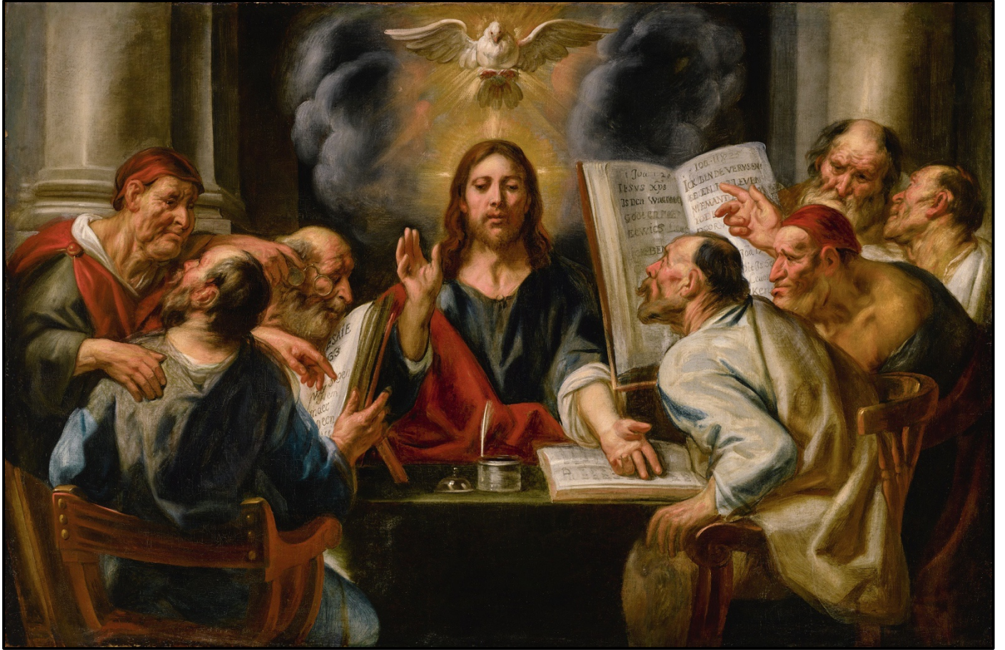
“Christ among the Pharisees” by Jacob Jordaens, ~ 1660s

Saint Stephen’s Episcopal Church is a part of the Episcopal Diocese of Montana 1241 Crawford Drive Billings, Montana 59102 Office Phone: (406) 259-5017 Email: ststephensmt@gmail.com