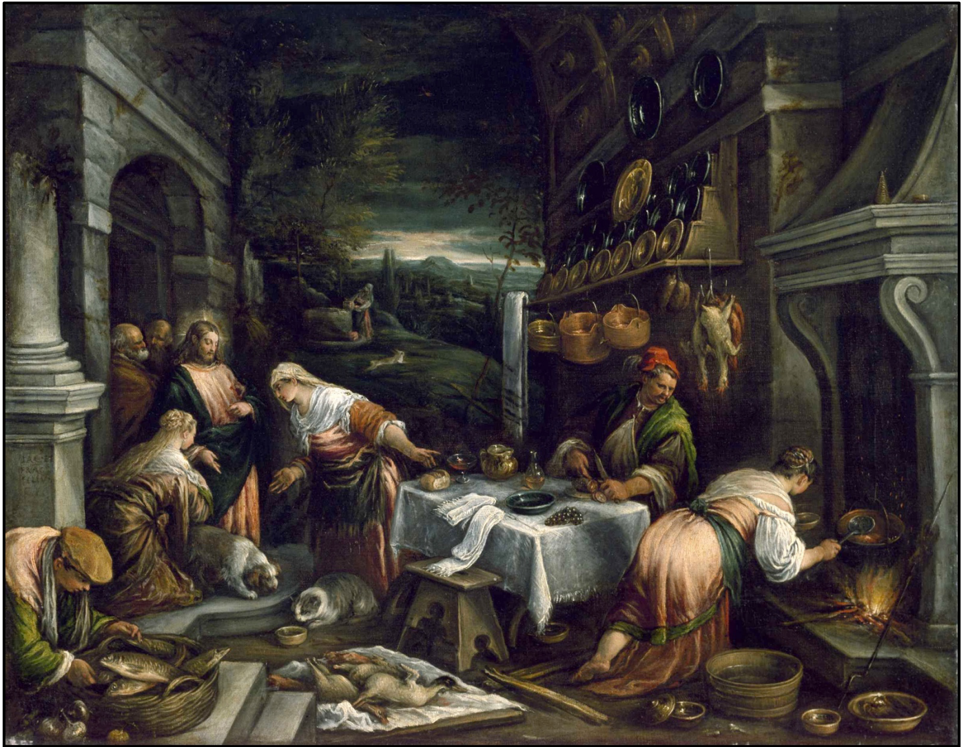
“Christ in the House of Mary, Martha, and Lazarus” by Jacopo Bassano, 1577

Saint Stephen’s Episcopal Church is a part of the Episcopal Diocese of Montana 1241 Crawford Drive Billings, Montana 59102 Office Phone: (406) 259-5017 Email: ststephensmt@gmail.com