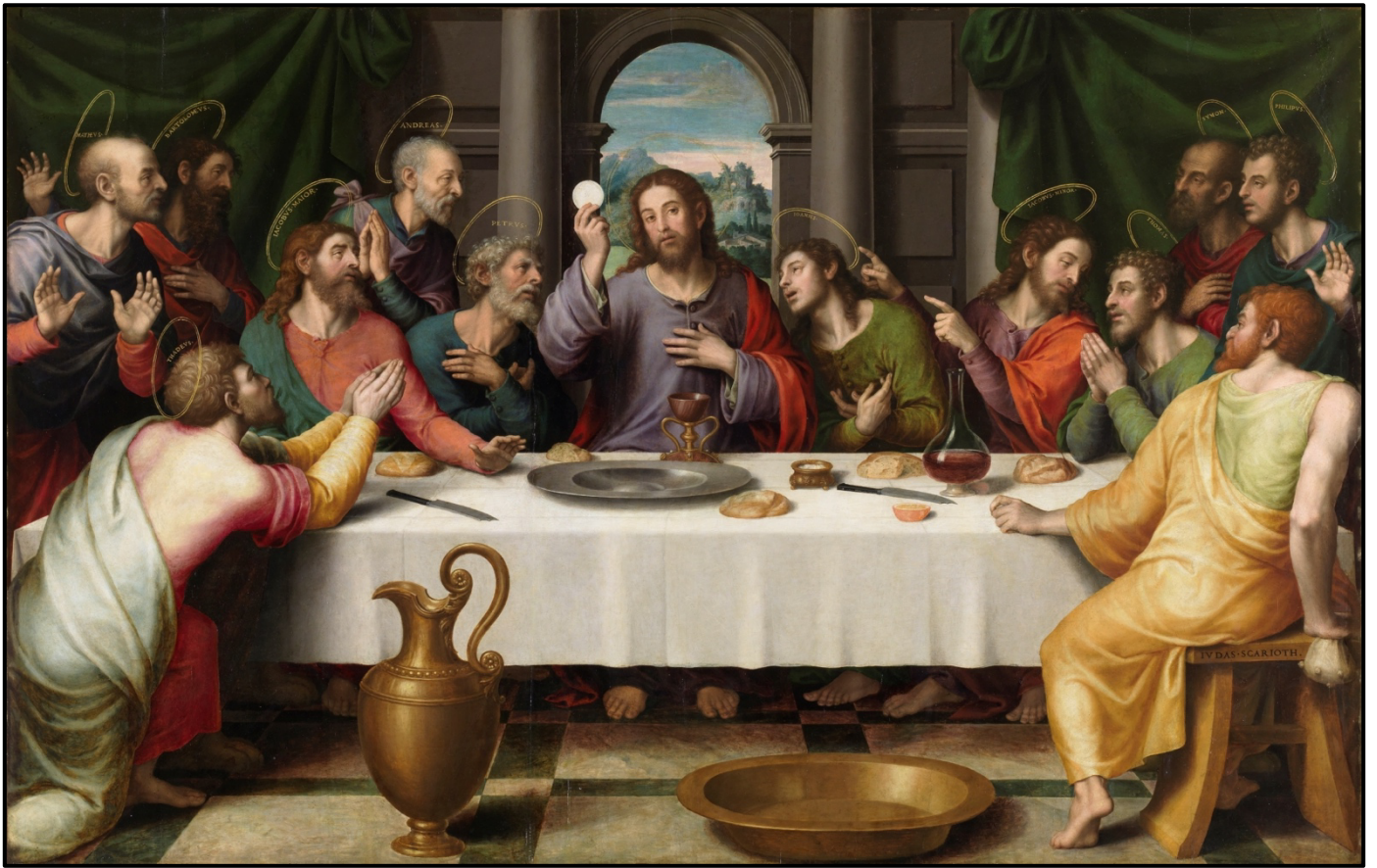
“The First Eucharist” by Juan de Juanes, mid-late 16th

Saint Stephen’s Episcopal Church is a part of the Episcopal Diocese of Montana 1241 Crawford Drive Billings, Montana 59102 Office Phone: (406) 259-5017 Email: ststephensmt@gmail.com