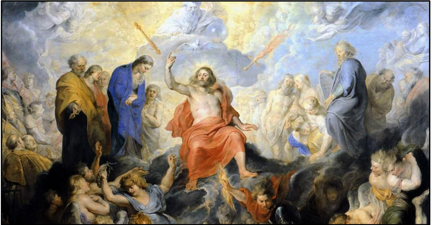
"Last Judgement" by Peter Paul Rubens, 1617

Saint Stephen's Episcopal Church is a part of the Episcopal Diocese of Montana