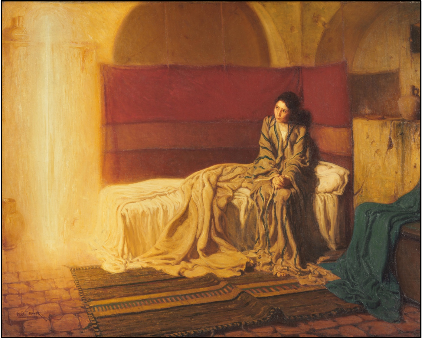
“Annunciation” by Henry Ossawa Tanner, 1898

Saint Stephen’s Episcopal Church is a part of the Episcopal Diocese of Montana