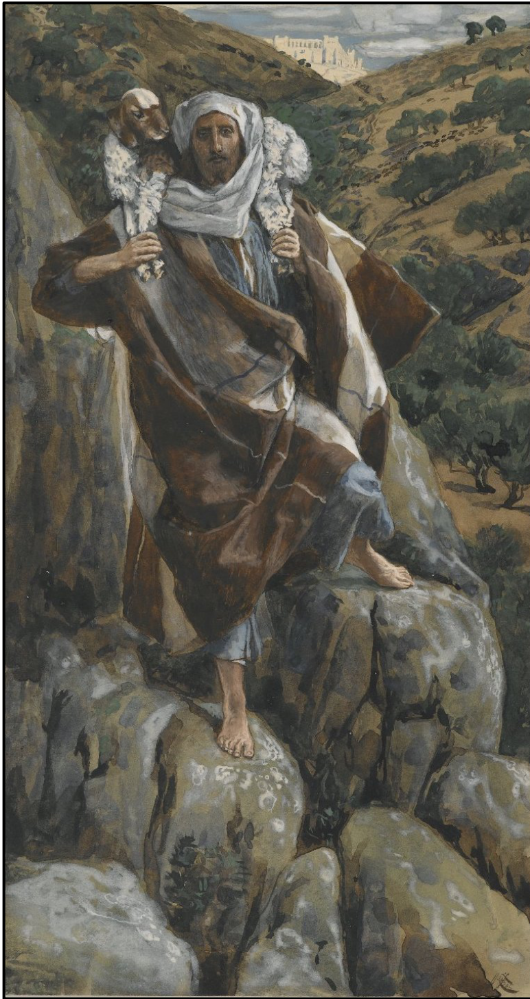
"The Good Shepherd (Le bon pasteur)" by James Tissot, 1886-1894

Saint Stephen's Episcopal Church is a part of the Episcopal Diocese of Montana