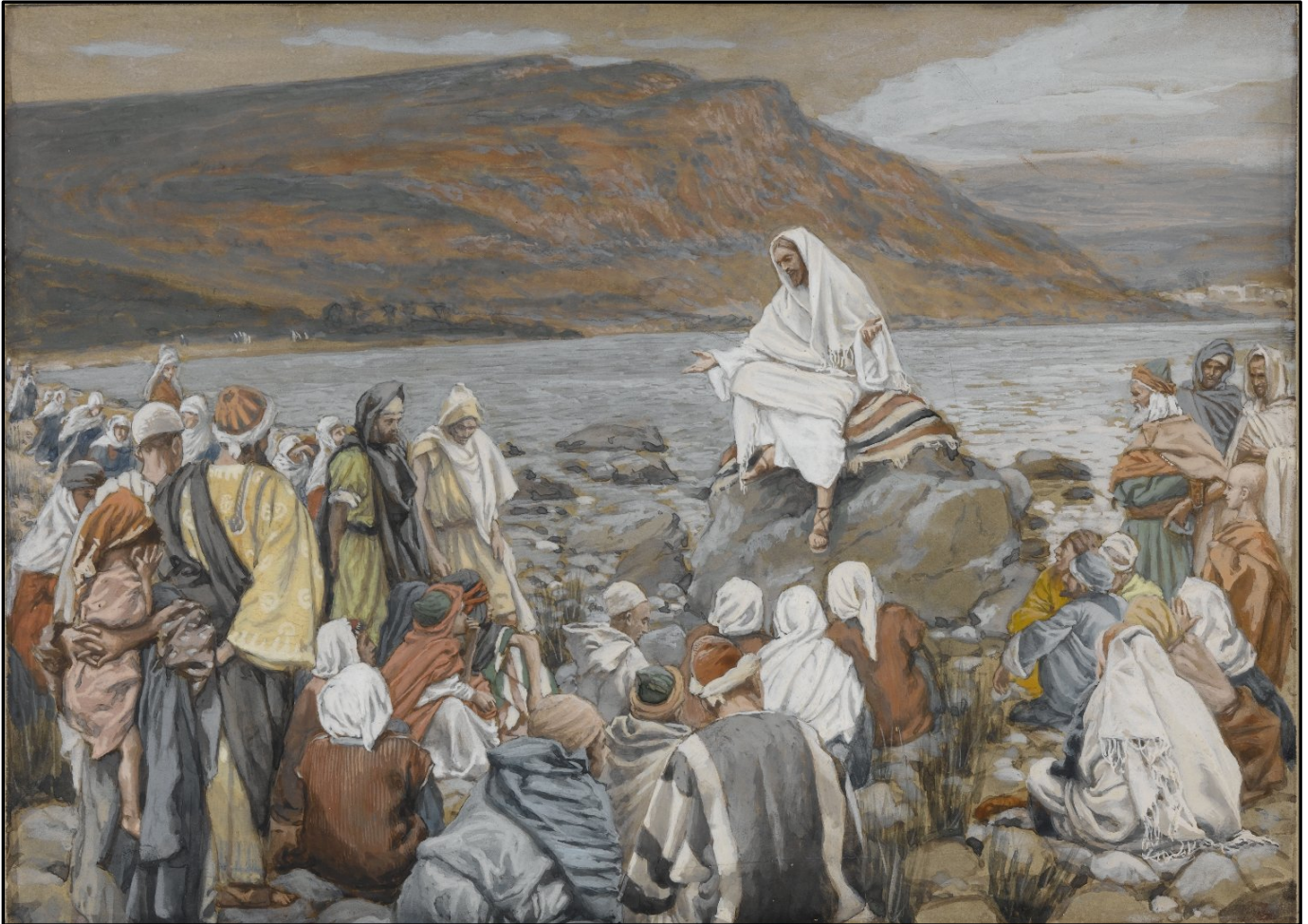
"The Master teaches his disciples at the sea" by James Tissot, 1886-1894

Saint Stephen's Episcopal Church is a part of the Episcopal Diocese of Montana 1241 Crawford Drive Billings, Montana 59102 Office Phone: (406) 259-5017 Email: ststephensmt@gmail.com