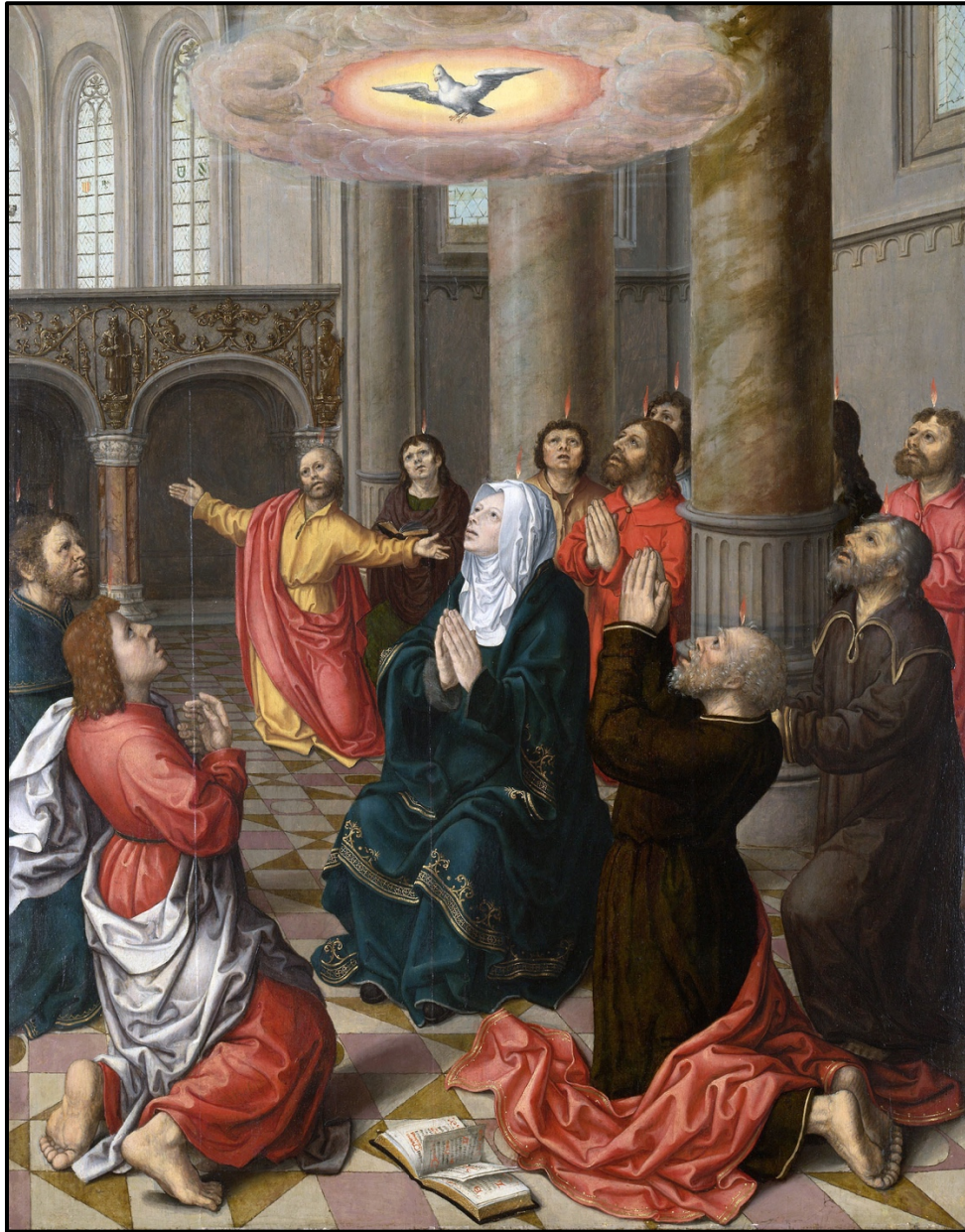
"Pentecost" by Bernard van Orley, 1520 - 1525

Saint Stephen's Episcopal Church is a part of the Episcopal Diocese of Montana 1241 Crawford Drive Billings, Montana 59102 Office Phone: (406) 259-5017 Email: ststephensmt@gmail.com