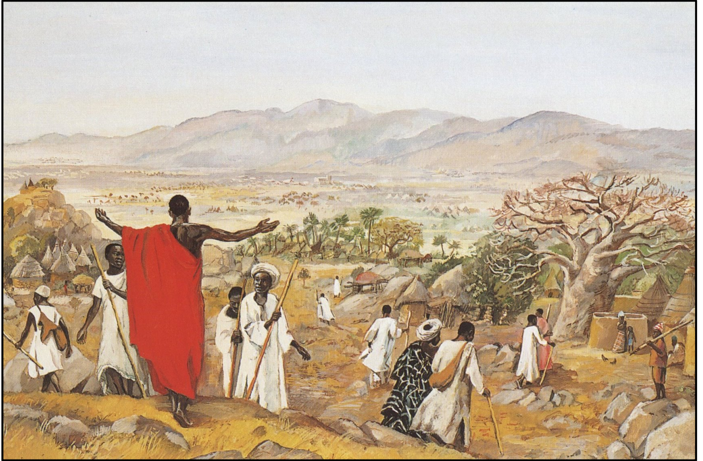
"The mission to the world" by JESUS MAFA, 1973

Saint Stephen's Episcopal Church is a part of the Episcopal Diocese of Montana 1241 Crawford Drive Billings, Montana 59102 Office Phone: (406) 259-5017 Email: ststephensmt@gmail.com