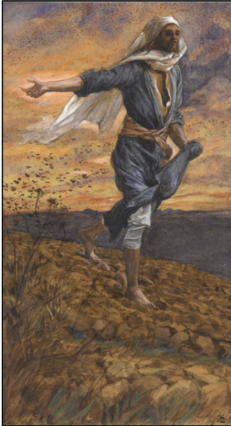
"Sower" by James Tissot, 1886 - 1894

Saint Stephen's Episcopal Church is a part of the Episcopal Diocese of Montana