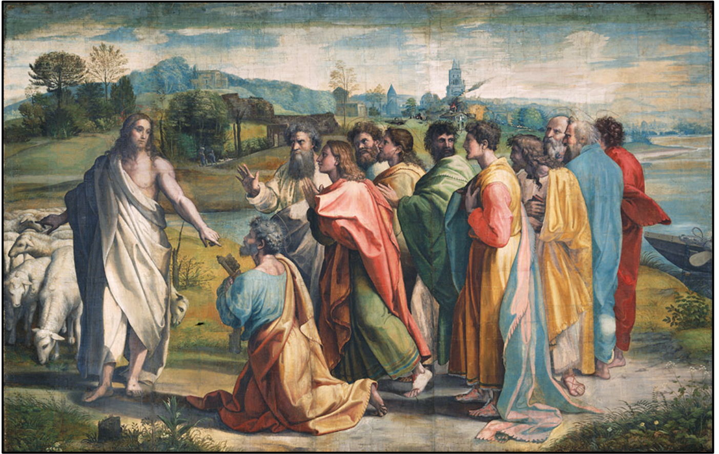
"Christ's Charge to Peter" by Raphael, 1515-1516

Saint Stephen's Episcopal Church is a part of the Episcopal Diocese of Montana 1241 Crawford Drive Billings, Montana 59102 Office Phone: (406) 259-5017 Email: ststephensmt@gmail.com