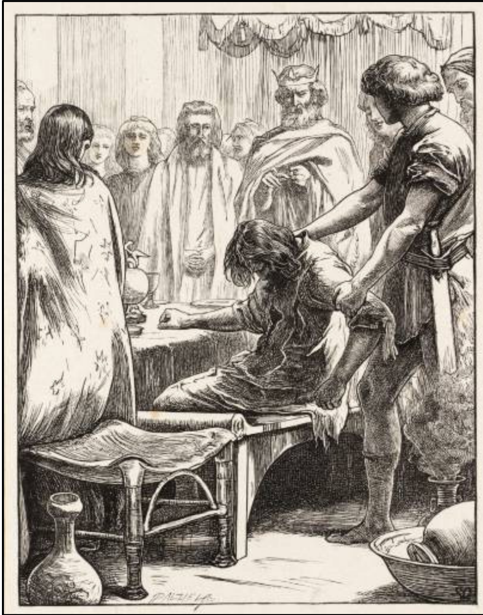
"The Marriage Feast" by John Everett Millais, 1864

Saint Stephen's Episcopal Church is a part of the Episcopal Diocese of Montana 1241 Crawford Drive Billings, Montana 59102 Office Phone: (406) 259-5017 Email: ststephensmt@gmail.com