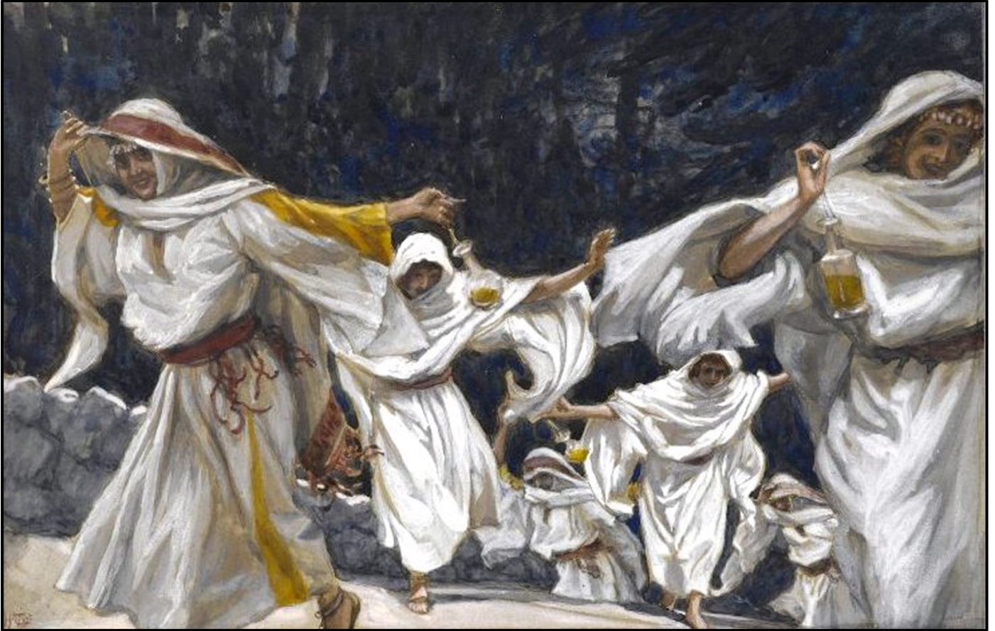
"Foolish Virgins" by James Tissot, 1886-1894

Saint Stephen's Episcopal Church is a part of the Episcopal Diocese of Montana 1241 Crawford Drive Billings, Montana 59102 Office Phone: (406) 259-5017 Email: ststephensmt@gmail.com