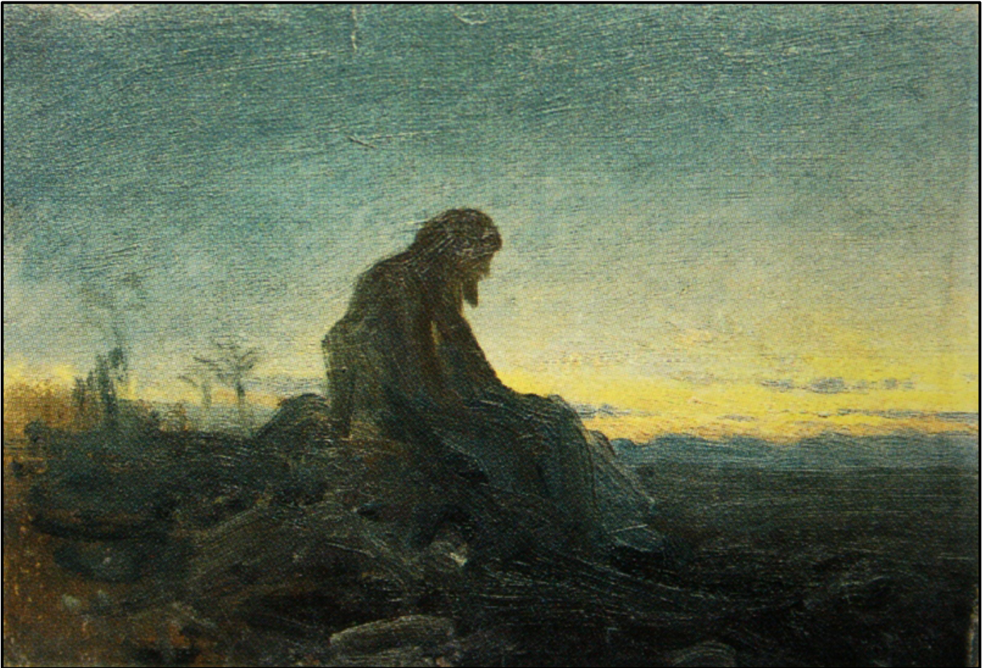
"Christ in the Wilderness" by Ivan Nikolaevich Kramskoi, 19 th century

Saint Stephen's Episcopal Church is a part of the Episcopal Diocese of Montana