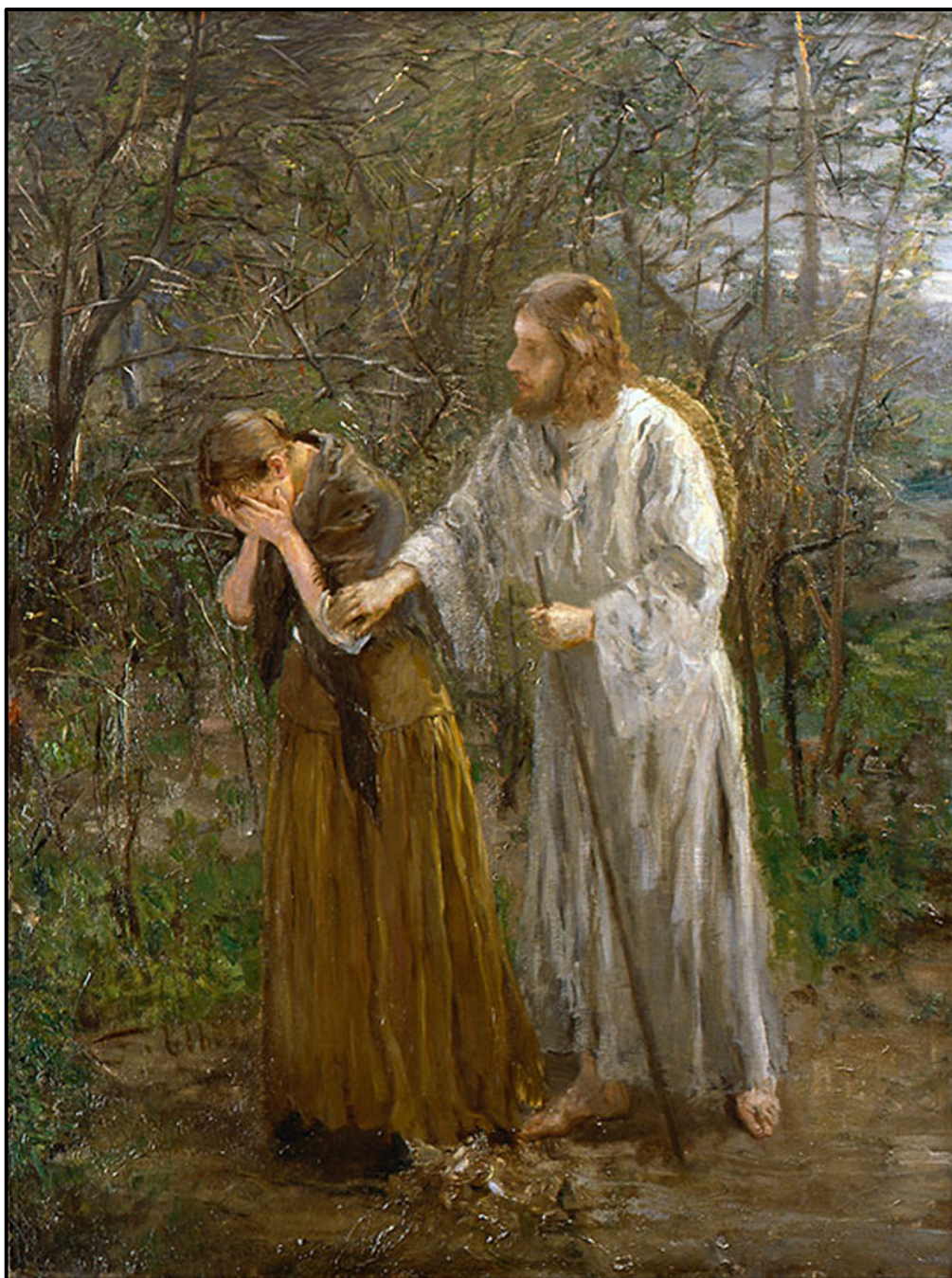
"Woman, Why Weepest Thou?" by Fritz von Uhde, 1892-1894

Saint Stephen's Episcopal Church is a part of the Episcopal Diocese of Montana