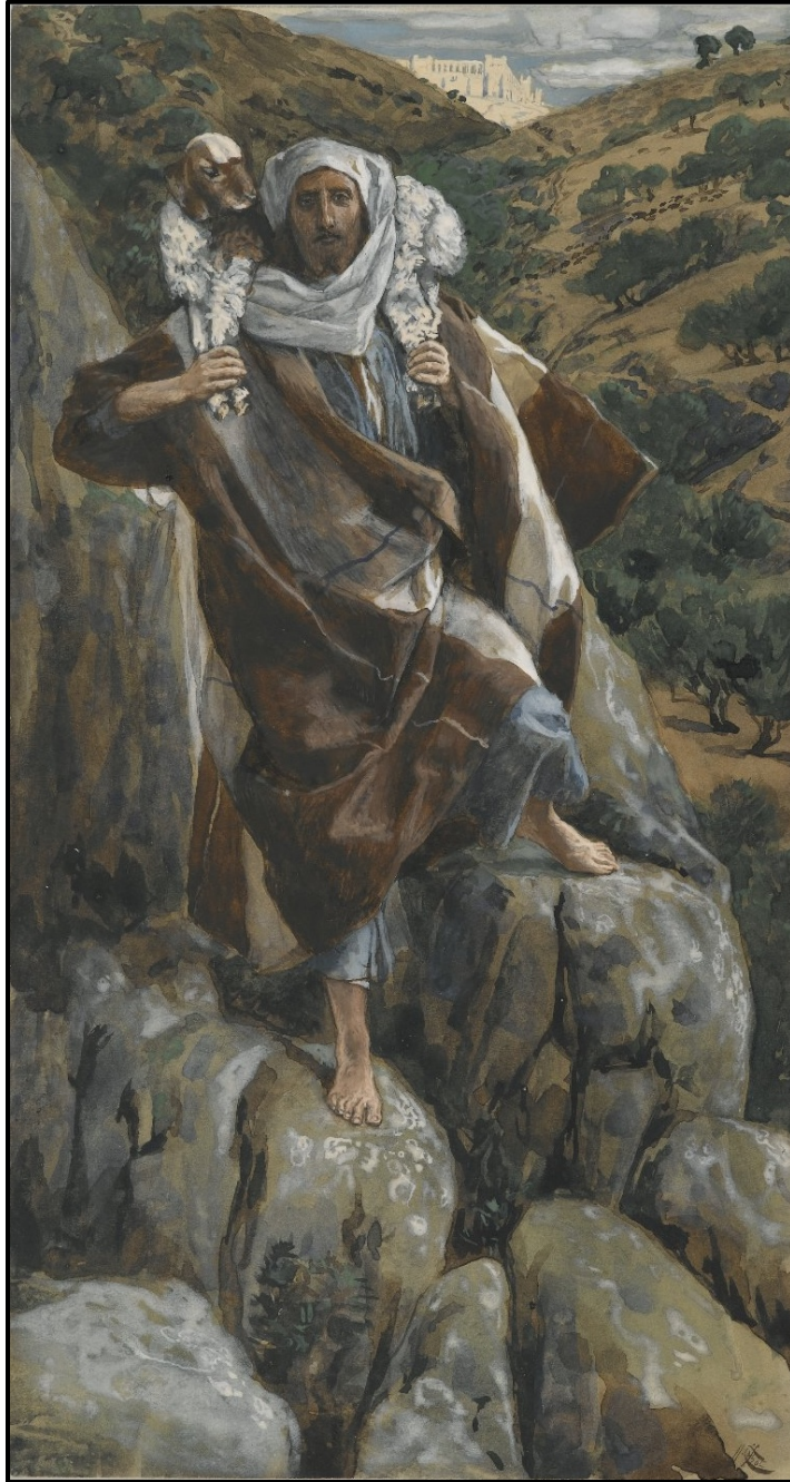
The Good Shepherd (Le bon pasteur) by James Tissot, 1886 - 1894

Saint Stephen's Episcopal Church is a part of the Episcopal Diocese of Montana