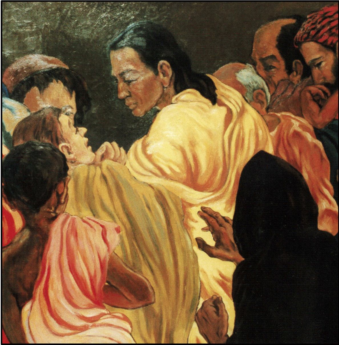
"Woman with the Flow of Blood" by Frank Wesley, 20th century