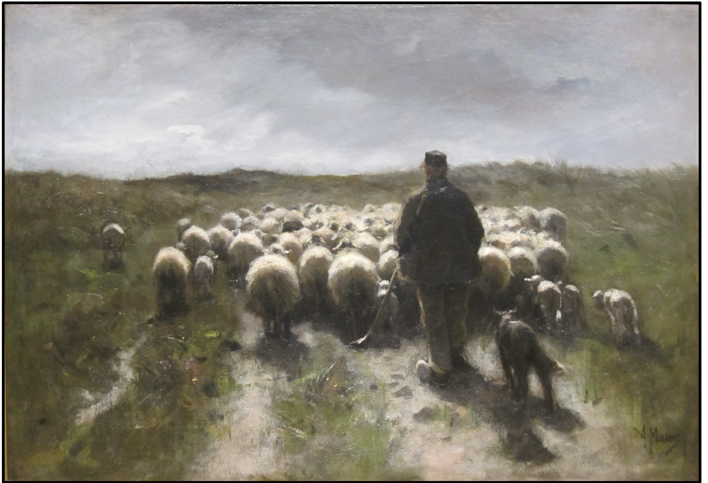
"Landscape with Shepherd and Sheep" by Anton Mauve, 1880