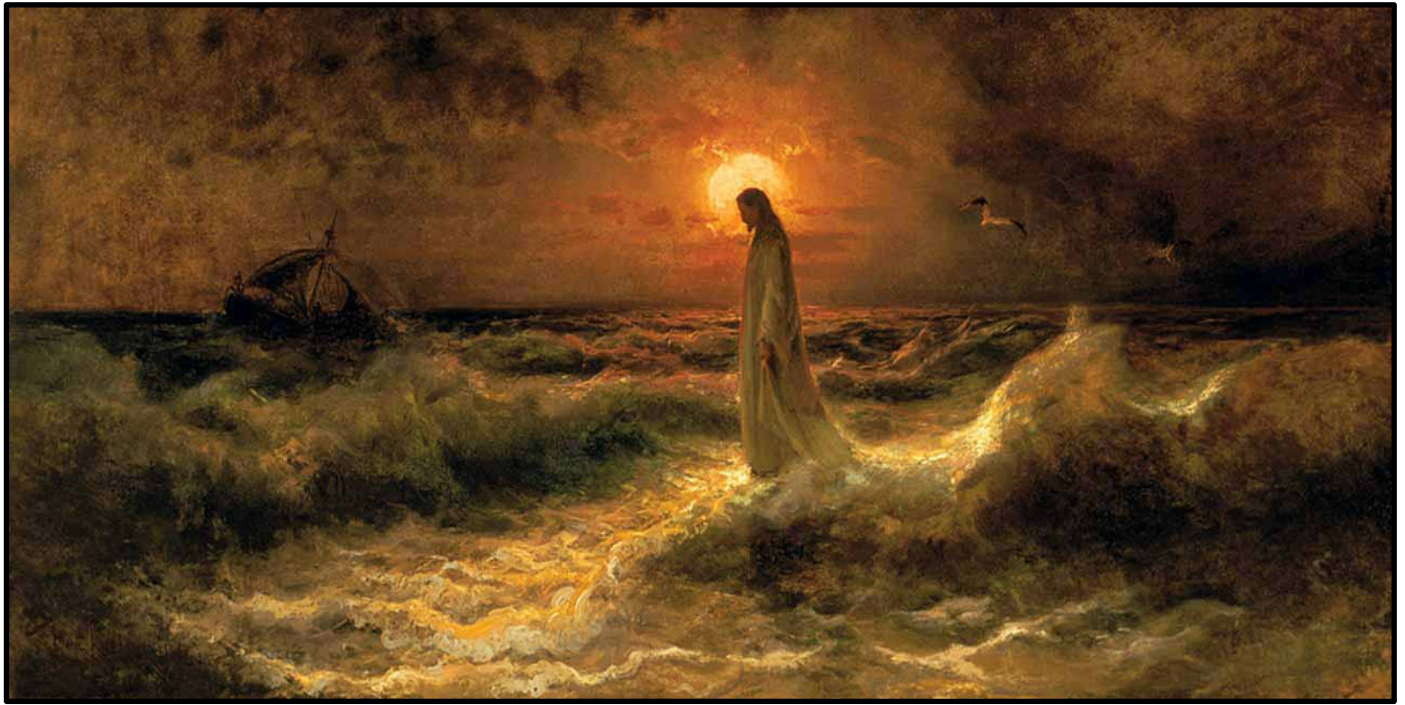
“Christ Walking on Water” by Julius Sergius von Klever, 1880