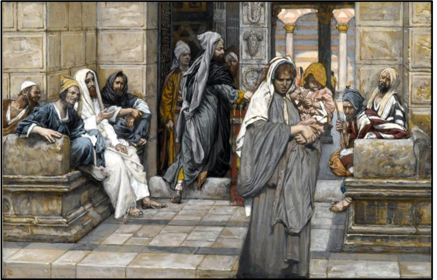
"Widow's Mite" by James Tissot, 1886-1894