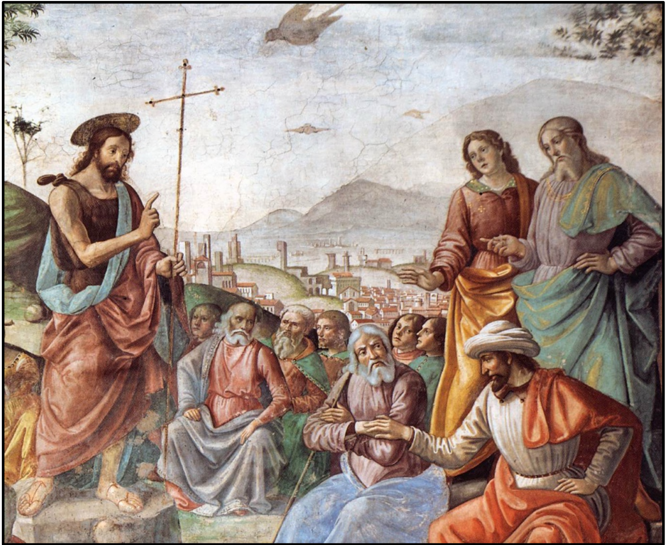
"John the Baptist Preaching" by Domenico Ghirlandaio, 1486-1490