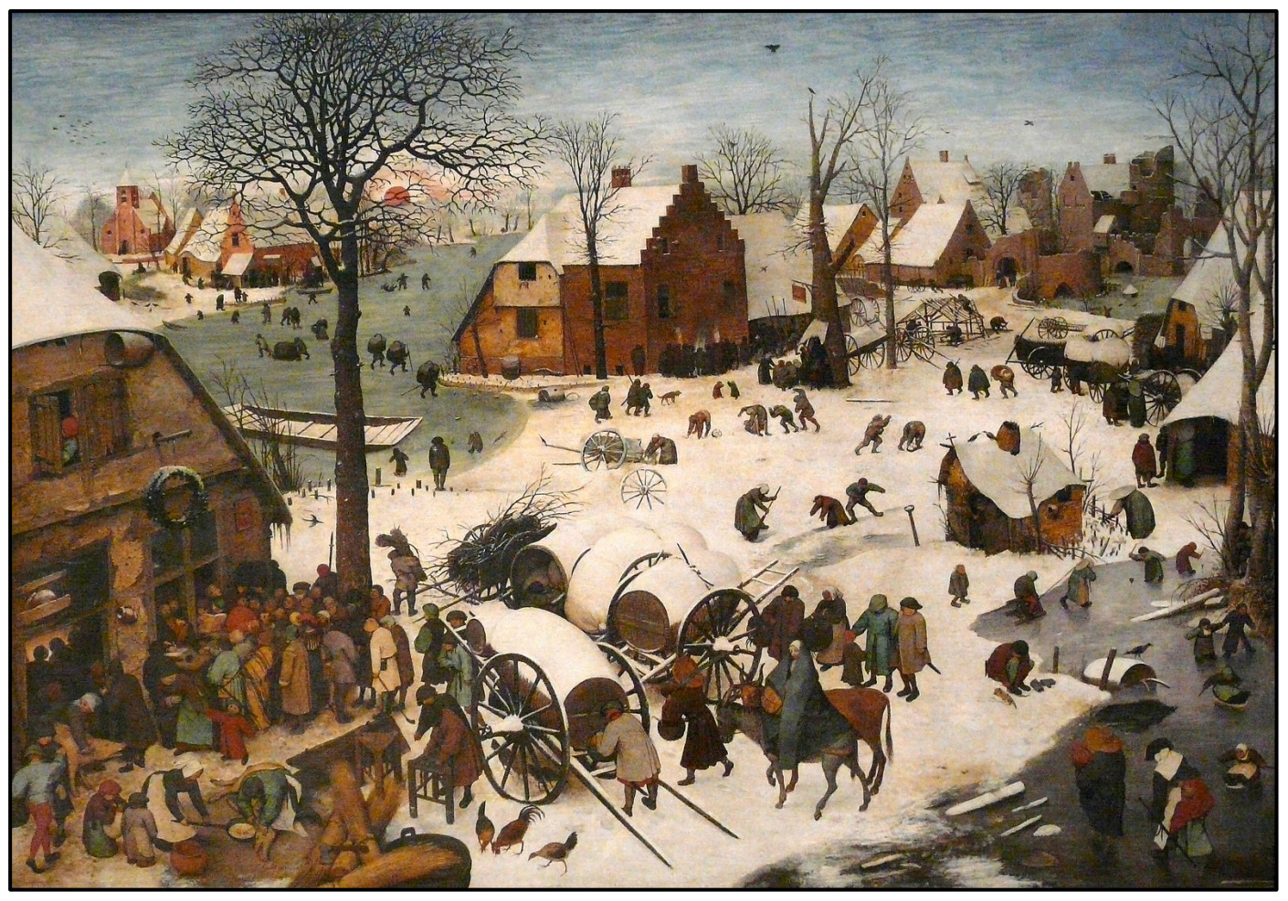
"Census at Bethlehem" by Pieter Bruegel, 1566