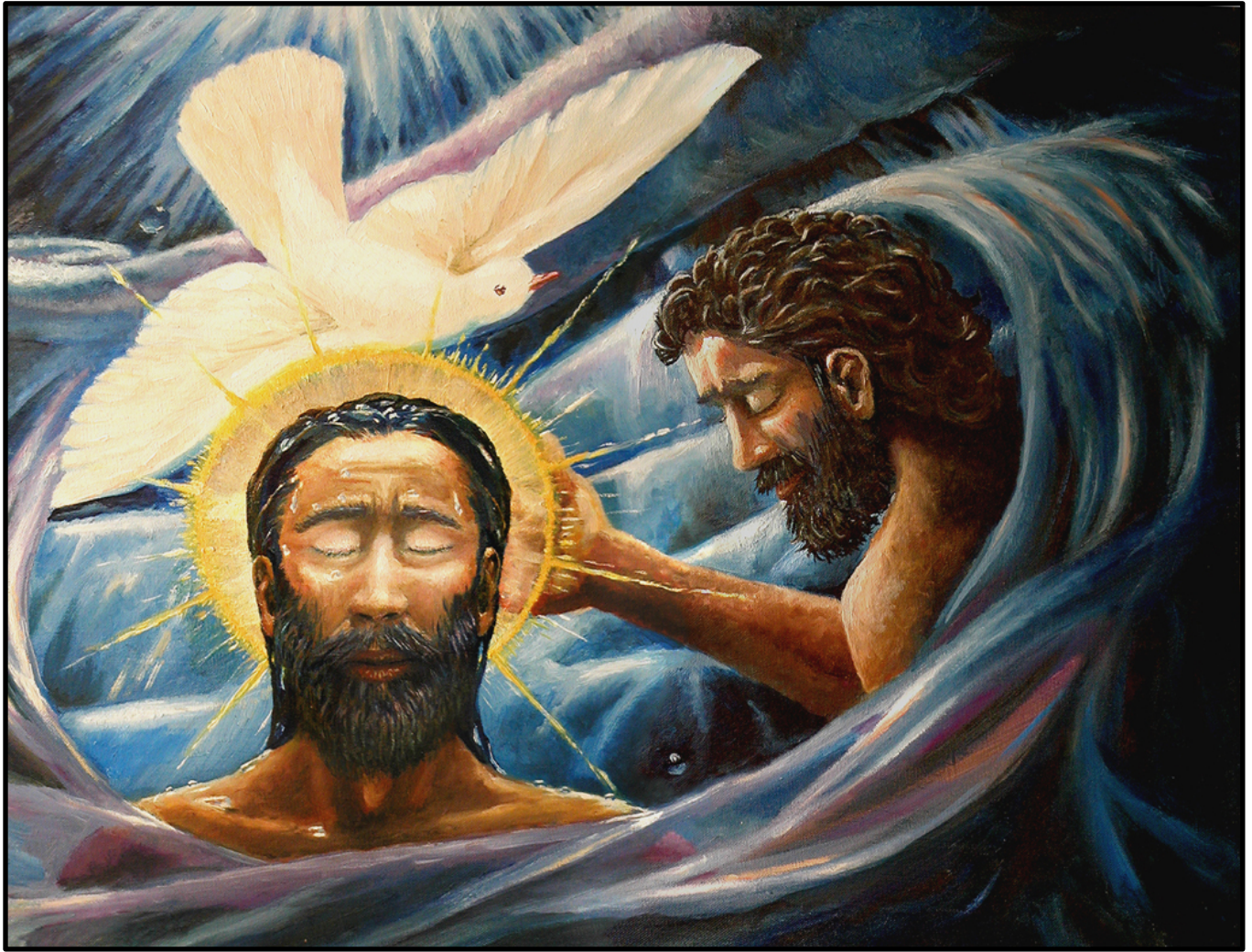
"Baptism of Christ" by Dave Zelenka, 2005