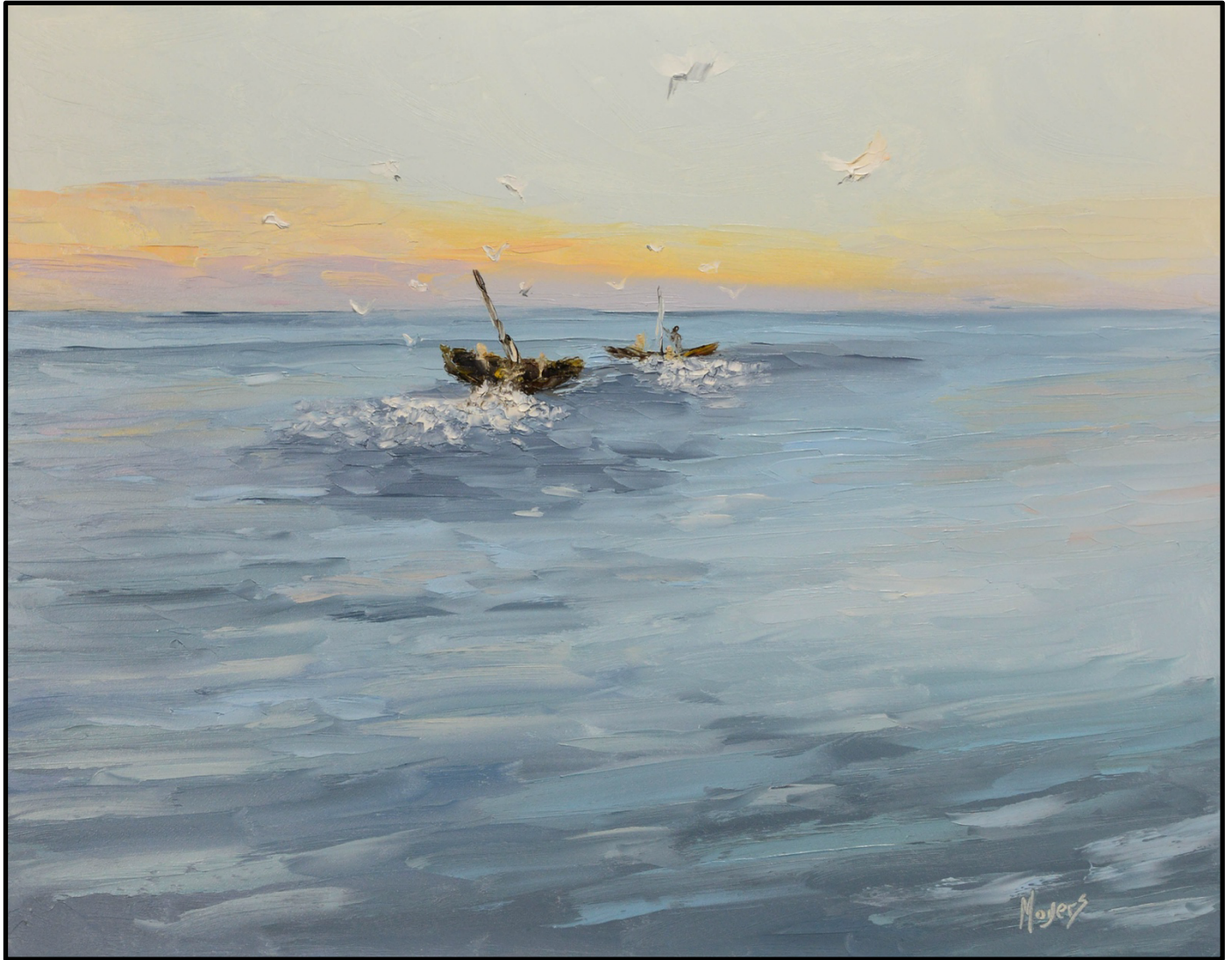
"Miracle Catch" by Mike Moyers, 2019