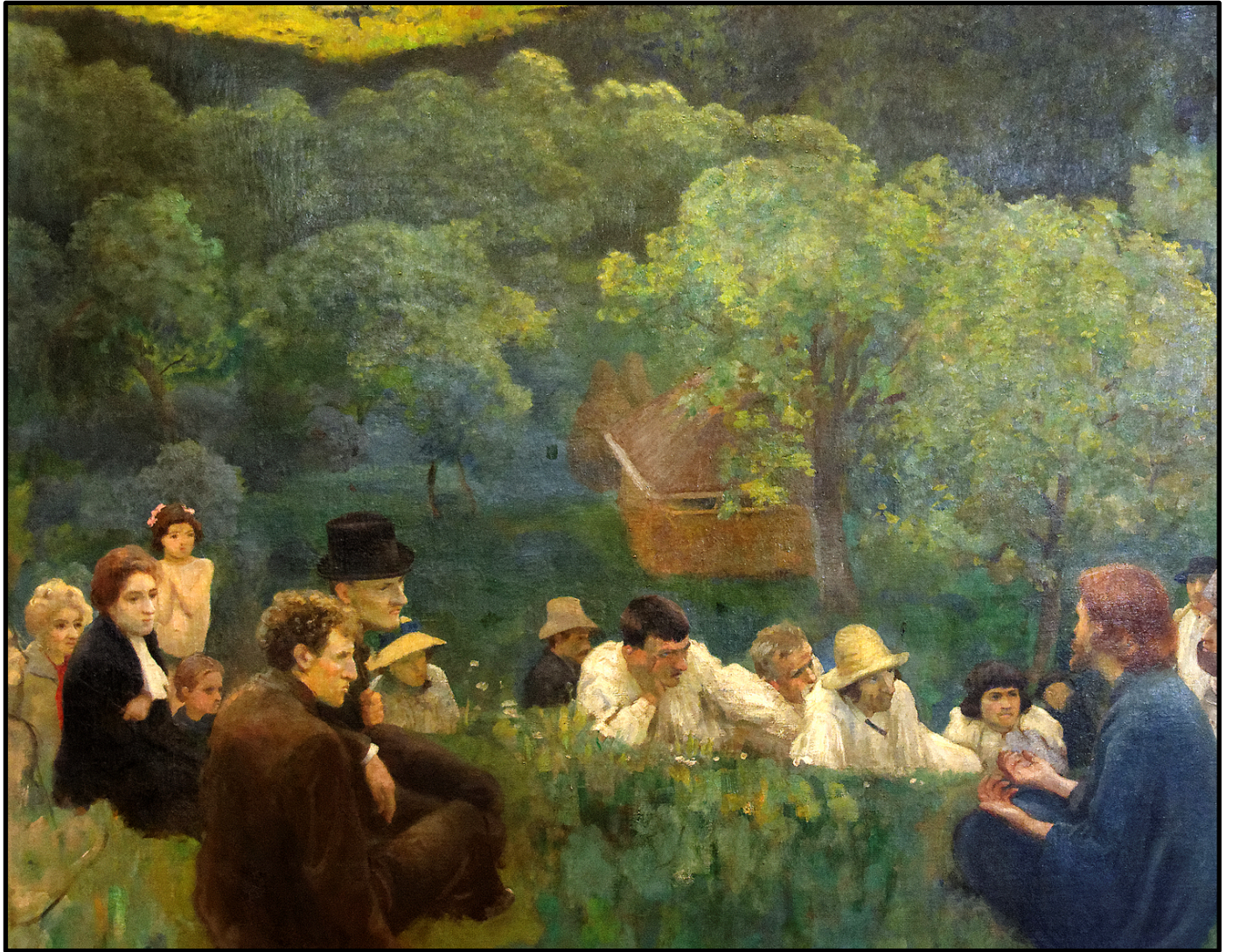
“Sermon on the Mount” by Károly Ferenczy, 1896