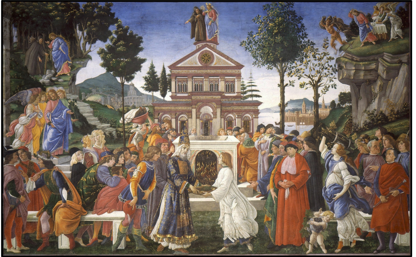
“The Temptations of Christ” by Sandro Botticelli, 1480–1482