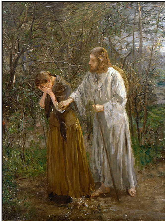
"Woman, Why Weepest Thou?" by Fritz von Uhde, 1892-1894

Walk in love, as Christ loved us and gave Himself for us, an offering and sacrifice to God. Psalm 96:8, Ephesians 5:2