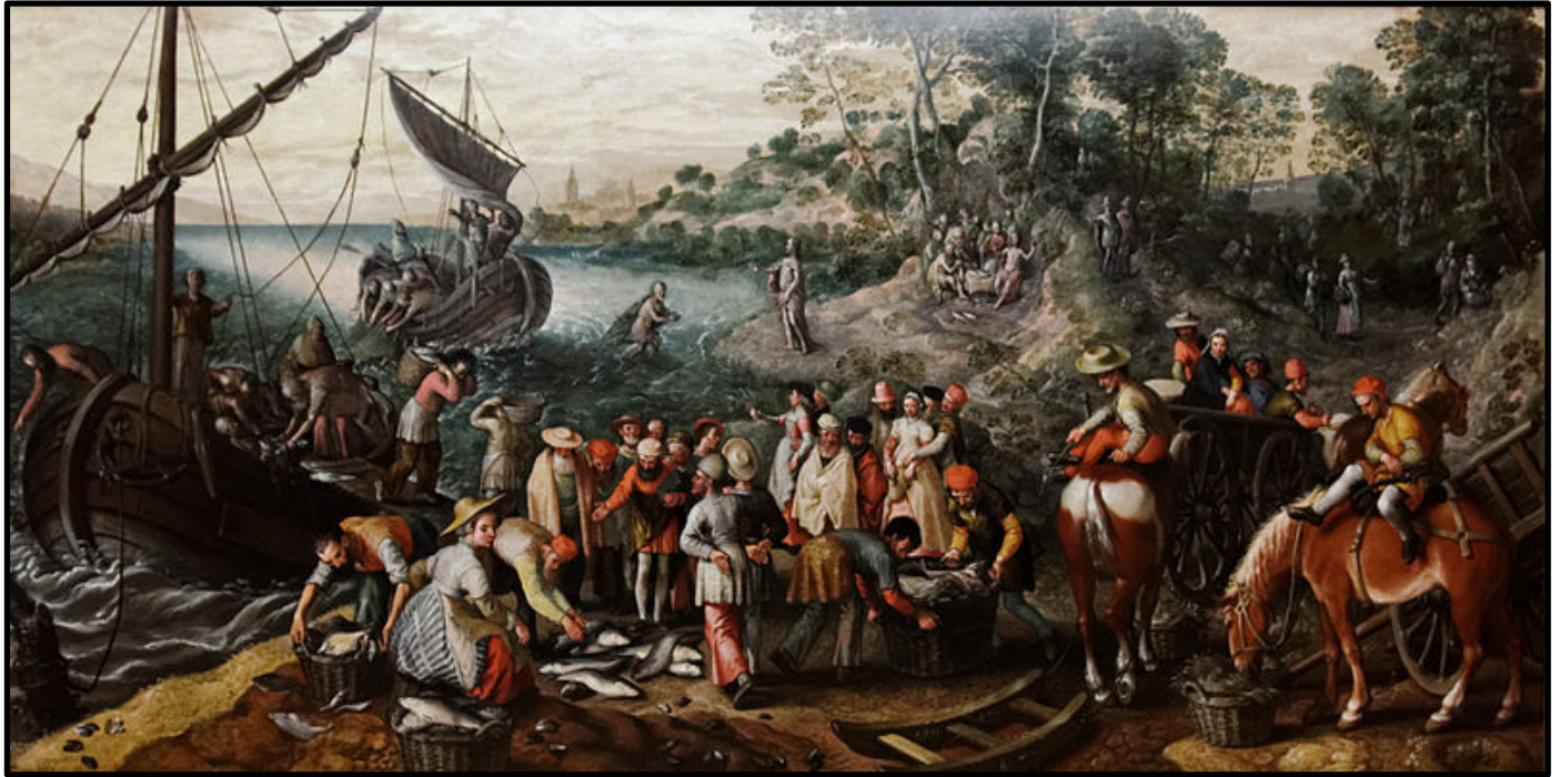
"Miraculous Draught of Fishes" by Joachim Beuckelaer, 1563