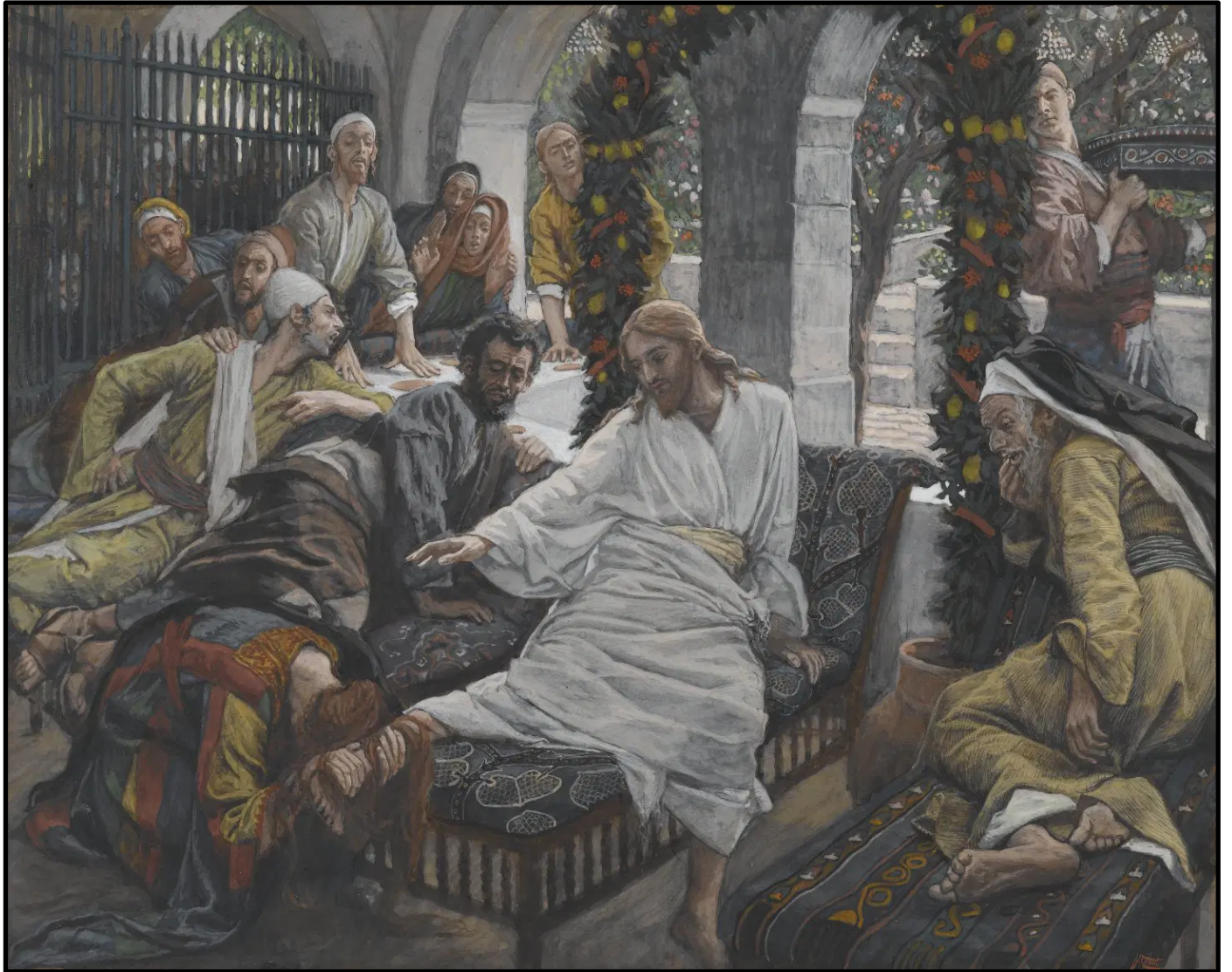
"The Ointment of the Magdalene" by James Tissot, late 19th century