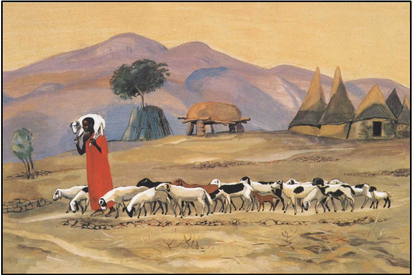
"The good shepherd" by JESUS MAFA, 1973