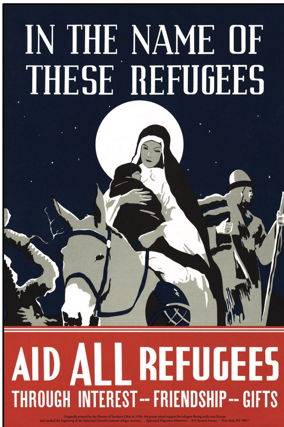
Poster by The Episcopal Diocese of Southern Ohio, 1939